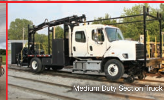
Medium Duty Section Truck